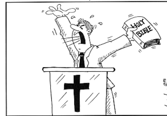
"As we enter this football season, let me make one thing perfectly clear. Jesus would never use the West Coast offense against a 4-3-4 zone defense!"

WEBSITE - www.jenkinscp.org PASTOR - jenkinspastor@united.net OFFICE - jenkinsoffice@united.net YOUTH - jenkinscpvouth@gmail.com MUSIC - jenkinsmusic@united.net WOMENS MINISTRY – jenkinscpwm@yahoo.com